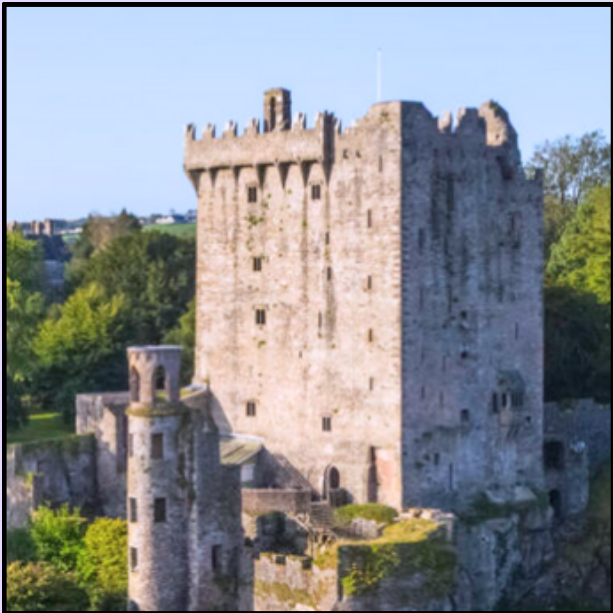
Blarney Castle, County Cork, Ireland