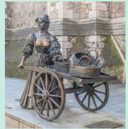
Molly Malone Statue, Dublin, Ireland